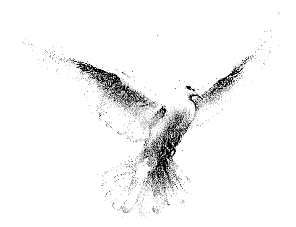
Lesson 13--Temporary Spiritual Gifts in the Body of Christ